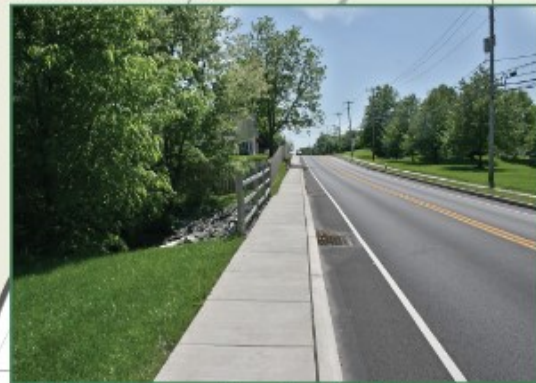
A. Sidewalk Connections-Completed 2016

$1,490,000 of funding received to date towards