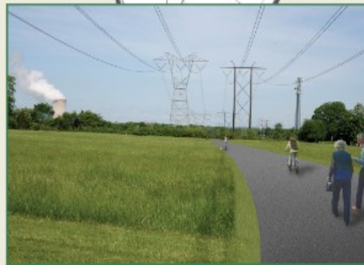
D. PECO Utility Trail Phase 1-Construction 2018, under construction