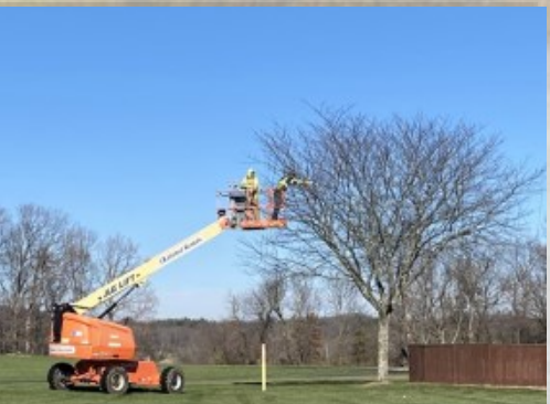
Tree Trimming in Limerick Community Park

For construction of and on Township roads, right-of-ways or other structures being dedicated, owned, or maintained by the Township.