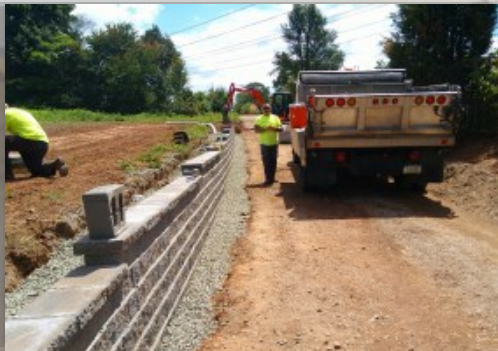
Retaining Wall & Trail Construction

Today is no different. Our Department's professionals are capable of performing a wide range of projects in-house. By utilizing their expertise and resources, communities can avoid the need to outsource work to private contractors, saving