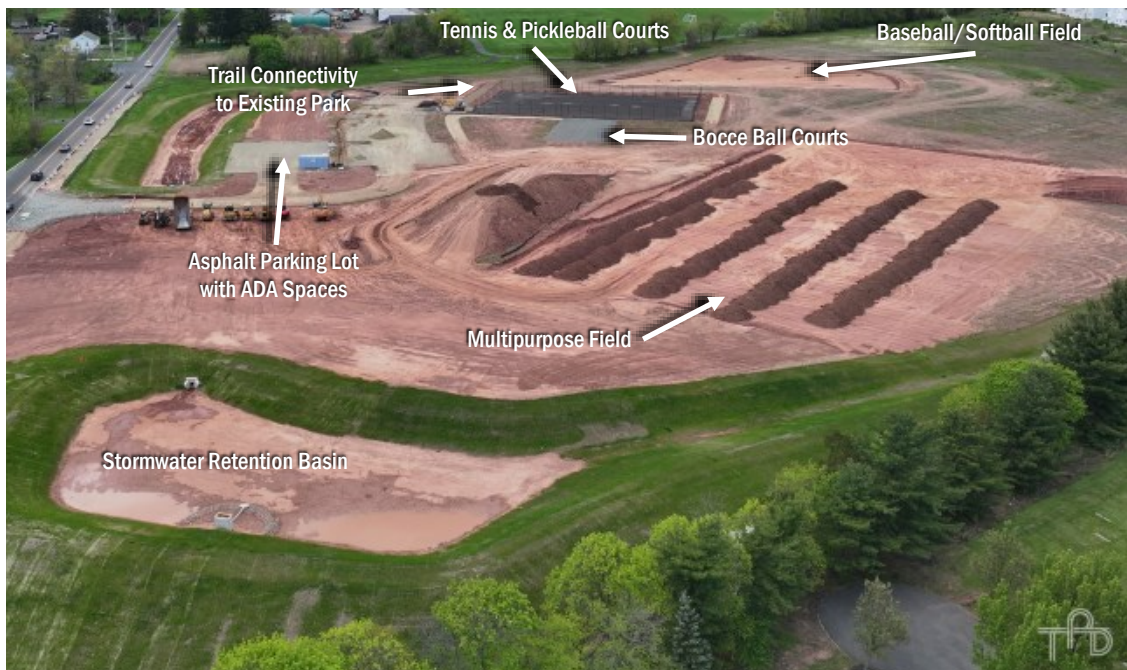
Limerick Community Park Expansion Project - Phase I