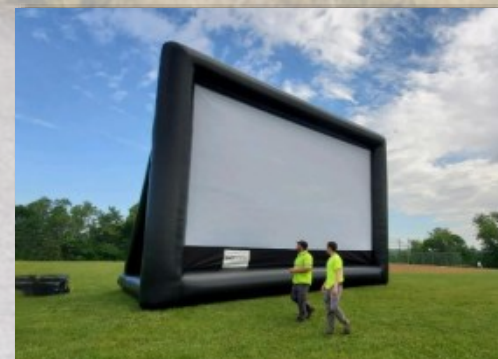
Events in the Park: Set Up & Break Down

Over the past decade, the department has saved Limerick taxpayers close to $3 MILLION by completing this work in-house.