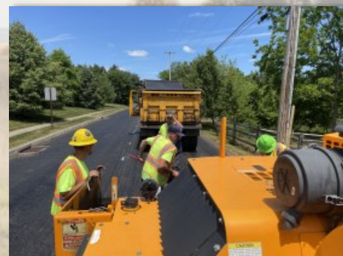
Paving Work on Township Roadways

In all phases of the trades, skills, and knowledge required to perform the many and various duties of the department.