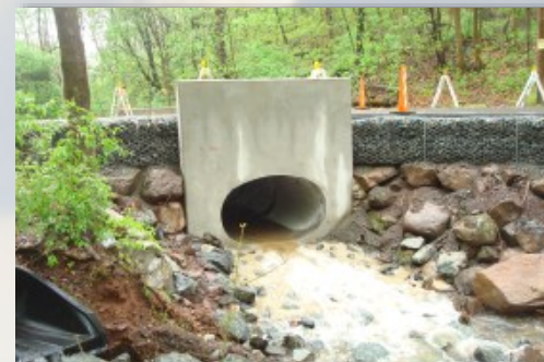
Culvert Restoration Work

With over 100 miles of roadway, 40 traffic signals and flashers, 6 parks, 70+ vehicles/pieces of equipment and several facility buildings to take care of, our Public Works Department is constantly on the move. The Department provides and sustains structures and services essential to the welfare and quality of life for our community.