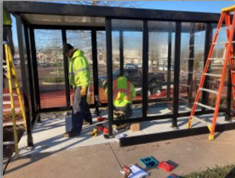
Bus Stop Installation