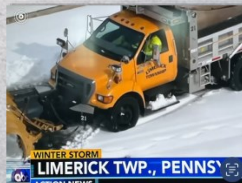
Winter Snow Removal

Over the past decade, the department has saved Limerick taxpayers close to $3 MILLION by completing this work in-house.