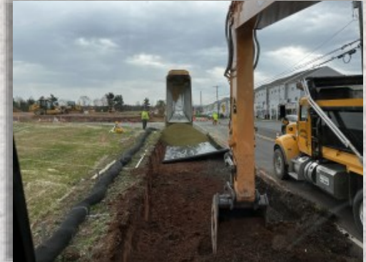
In-House Project: Limerick Community Park