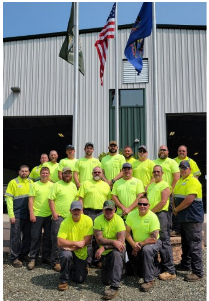
Our Public Works Team