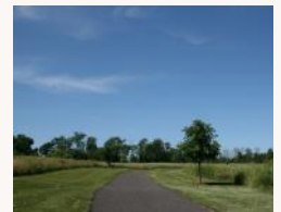
Parks & open space