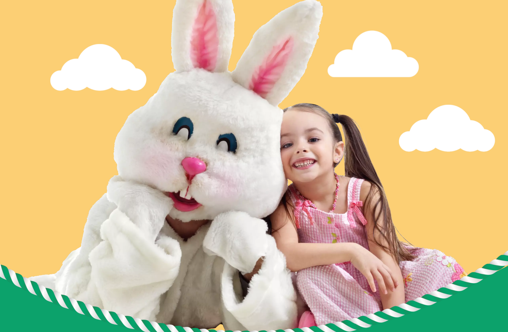
Photo with Easter Bunny