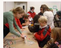
Activities for all ages