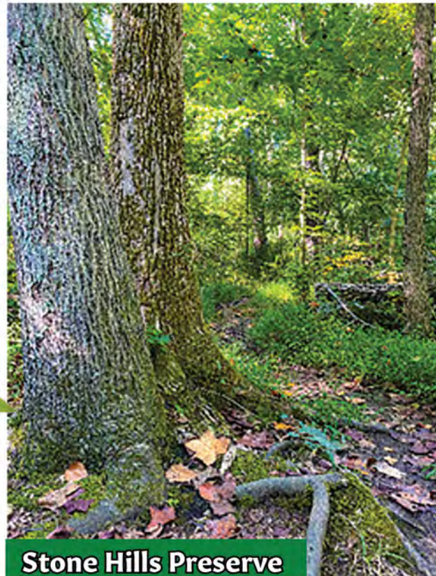
Stone Hills Preserve

To view additional park and rental information please visit the Parks & Recreation Department at www.limerickpa.org .