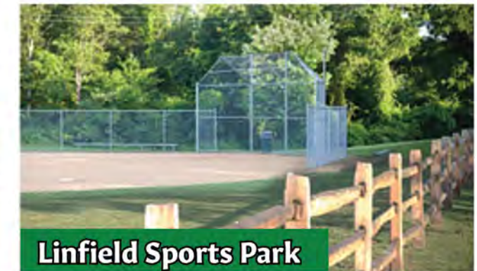
Linfield Sports Park