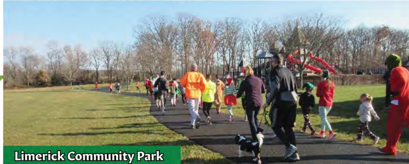
Limerick Community Park