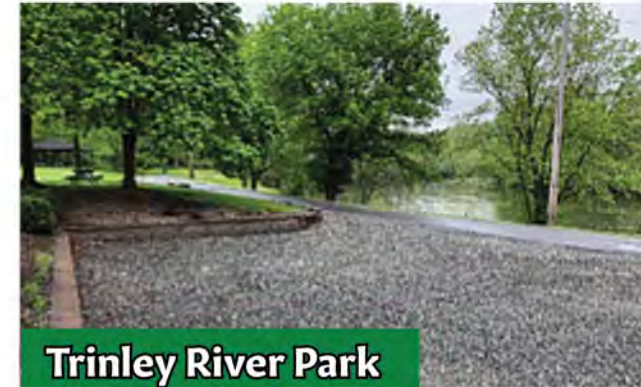
Trinley River Park

Limerick Township provides recreation programs for every age group, every season of the year. Please visit our website at www.limerickpa.org and refer to the Parks & Recreation Department.