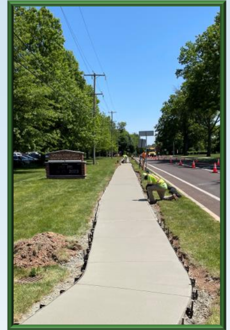
Sidewalk progress in front of Spring-Ford HS

The original project cost was estimated at $1.1 million in 2019 and the Township secured a Commonwealth Financing Authority (CFA) Multimodal Transportation Fund (MTF) Grant in the amount $783,421, with Capital Reserve funds and neighboring municipalities contributing the required matching grant funds. However, during the PennDOT approval process, additional design changes were required which delayed the project and increased costs. Inflation also became a factor and the project cost rose to $1,598,697. Fortunately, State Representative Joe Ciresi was able to secure additional funding through the COVID-19 American Rescue Plan Act (ARPA) grant program from Pennsylvania's Department of Community and Economic Development (DCED) in the amount of $320,000, to close the remaining gap in project cost funding needed to keep this important project on track.