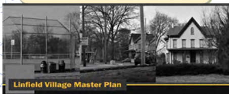
Linfield Village Master Plan

Improving Roadway Safety and Alleviating Congestion