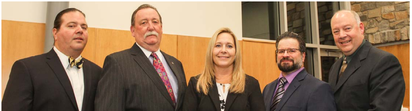
2021 Limerick Township Board of Supervisors (Pictured from Left to Right above)

PRSRT STD U.S. POSTAGE PAID PERMIT NO. 182 POTTSTOWN, PA 19464