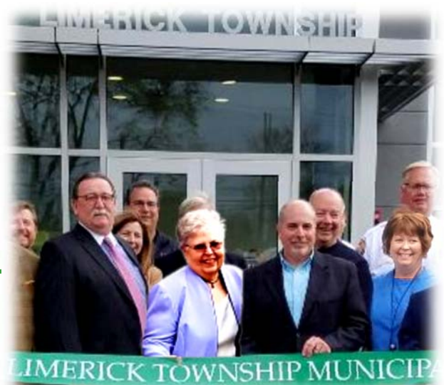
Police and Administration Building Dedication Ceremony