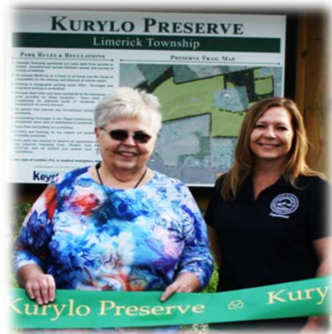
Kurylo Preserve Ribbon Cutting