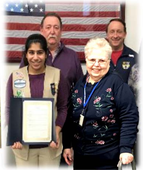
Supporter of Eagle Scouts and Girls Scout Gold Award Recipients in the Township